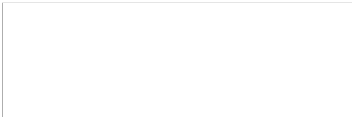
Figure 2. Example of a short caption, which should be centered.